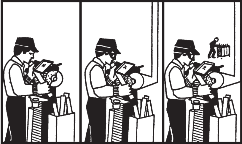
Figure 3. Grinding Castings: New Procedure or Protection

Figure 3 identifies the basic job steps for grinding iron castings and recommendations for new steps and protective measures.