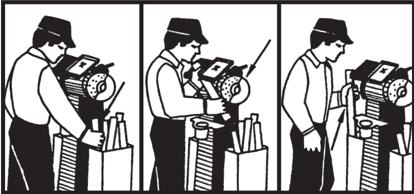
Figure 2. Grinding Castings: Hazards

Repeat the job observation as often as necessary until all hazards have been identified. Figure 2 shows basic job steps for grinding iron castings and any existing or potential hazards.