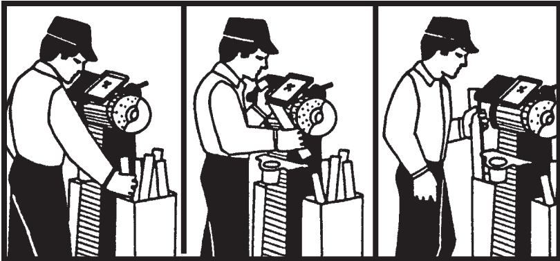
Figure 1. Grinding Castings: Job Steps

Figure 1 shows a worker performing the basic job steps for grinding iron castings.